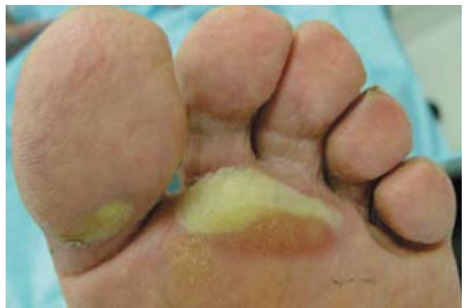
FIGURE 2. Hand-foot skin reaction as seen on the the foot

Previous studies of this syndrome suggest that histologically, the acute erythema of HFS is nonspecific and consistent with a generalized toxicity. Patterns of epidermal cytotoxic injury with mild lymphocyte-predominant dermal infiltrates are described. 2,3 Three histopathologic features predominate and are typically associated with traditional